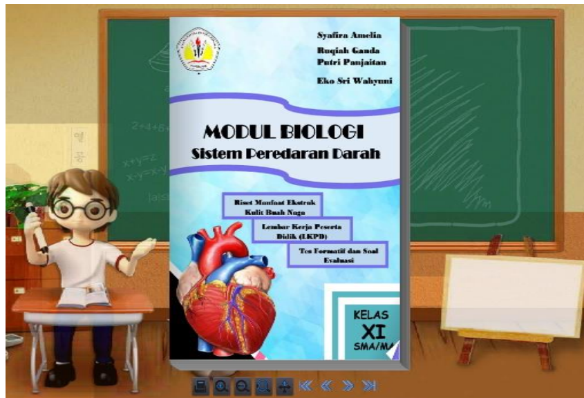
Figure 1. The e-module home page displays the title, material, level, and author's name, equipped with animations and navigation buttons

writing so that easy to read. The cover is more attractive, so displaying images, colour combinations, and matching font sizes is recommended (Magdalena et al., 2020). Other criteria are the presentation of KI, KD, GPA, learning objectives, and materials and examples adapted to the learning syllabus. Production of formative and evaluative tests and feedback and follow-up to measure how students understand the material being studied in the e-module. Presentation of answer keys, summaries, glossaries, and bibliography as a complement to the contents of e-modules that support students' independent learning. The cover layout view, it is presented in Figure 1. The evaluation sheet is shown in Figure 2. This module is also equipped with special information about the benefits of fruit peels which can be seen in Figure 3.